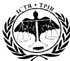
[Seal of the Tribunal]

Done this eighth day of April 2011, at The Hague, The Netherlands.